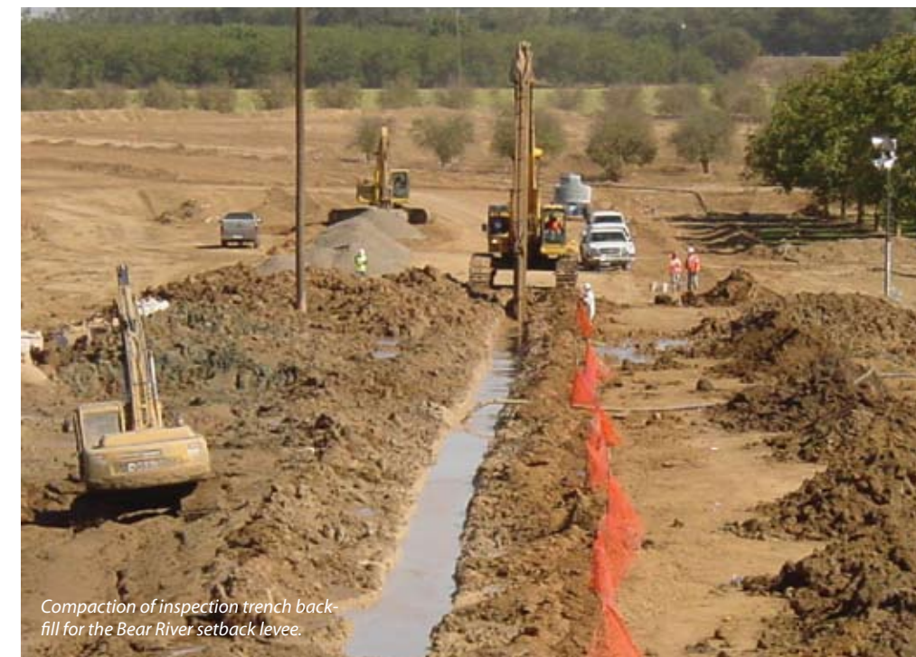
Compaction of inspection trench backfill for the Bear River setback levee.

Phase 3, Bear River setback levee between Feather River levee and the limit of Phase 2 construction. Construction of a setback embankment previously started with the building of a levee foundation. The contractor is now building the embankment. This project should also be completed by October 2006.