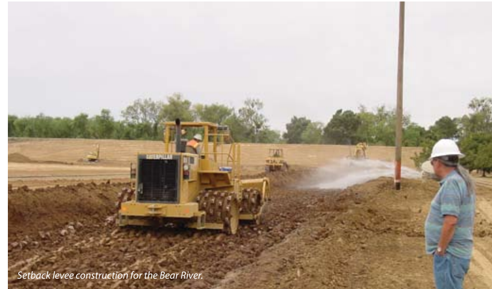
Setback levee construction for the Bear River.

of work on the Yuba and Feather rivers. This fourth phase will strengthen levees along the Yuba and Feather rivers.